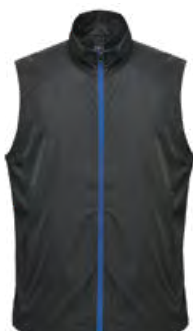
M'S & W'S: BLACK/CLASSIC BLUE