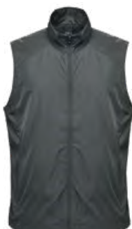
M'S & W'S: DOLPHIN