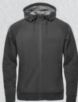
M'S & W'S: DOLPHIN