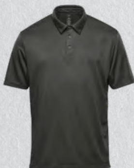
M'S & W'S: GRAPHITE