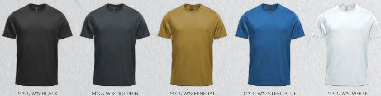
M'S & W'S: BLACK