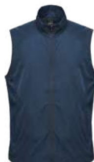
M'S & W'S: NAVY