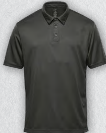
TREELINE PERFORMANCE S/S POLO PTS-1 | PTS-1W