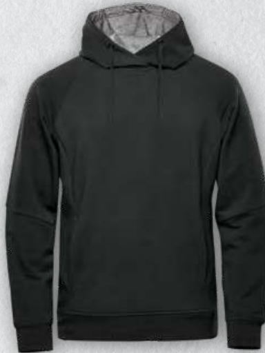
DOCKYARD PERFORMANCE HOODY CFH-3 | CFH-3W