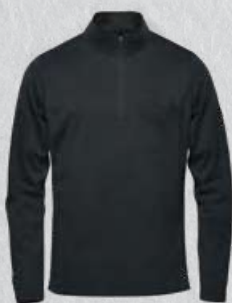
M'S & W'S: BLACK