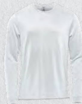
M'S & W'S: WHITE