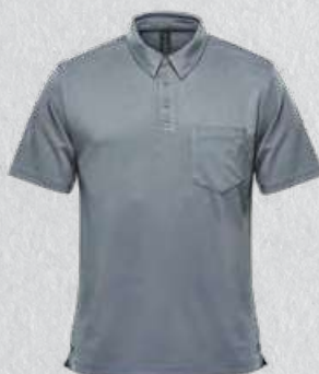
M'S & W'S: DOLPHIN HEATHER