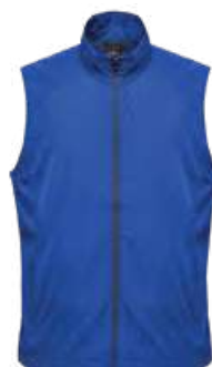
M'S & W'S: CLASSIC BLUE