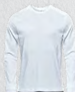
M'S & W'S: WHITE