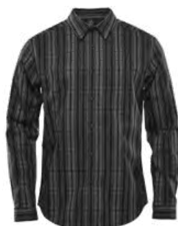
M'S & W'S: CARBON PLAID