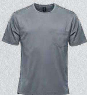
M'S & W'S: DOLPHIN HEATHER