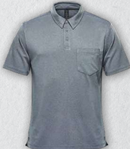
DOCKYARD PERFORMANCE S/S POLO VLX-1 | VLX-1W