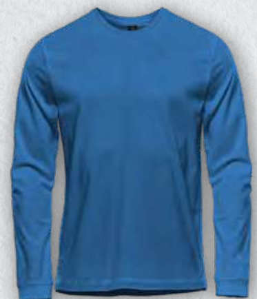
EQUINOX L/S TEE CPM-2 | CPM-2W