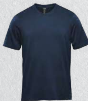
M'S & W'S: NAVY