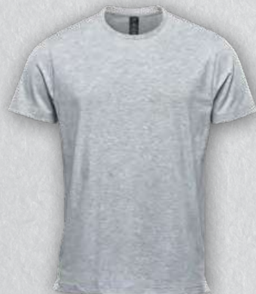
MONTEBELLO PERFORMANCE S/S TEE CPF-1 | CPF-1W