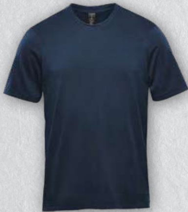
TUNDRA PERFORMANCE S/S TEE TFX-2 | TFX-2W