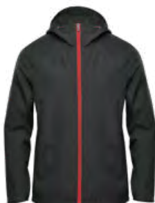
M'S & W'S: BLACK /BRIGHT RED