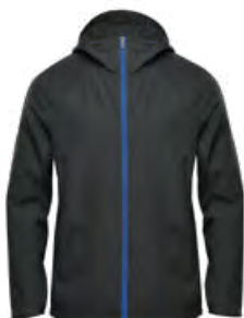
M'S & W'S: BLACK/ CLASSIC BLUE