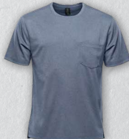
DOCKYARD PERFORMANCE S/S TEE VRX-1 | VRX-1W