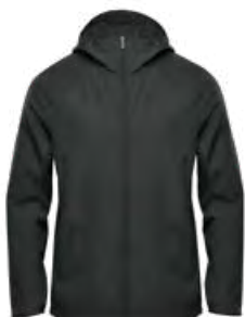
M'S & W'S: BLACK