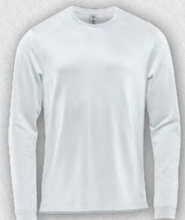
MONTEBELLO PERFORMANCE L/S TEE CPF-2 | CPF-2W