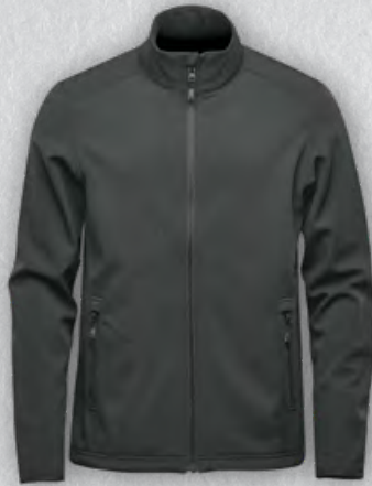
NARVIK SOFTSHELL KBR-1 | KBR-1W