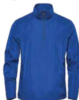
M'S & W'S: CLASSIC BLUE