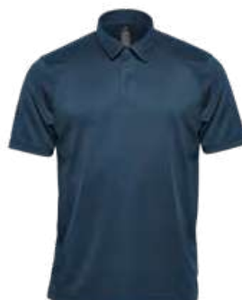
M'S & W'S: NAVY