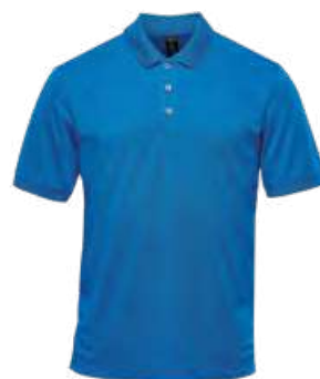
M'S & W'S: AZURE BLUE