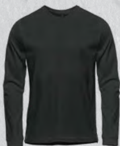
M'S & W'S: BLACK