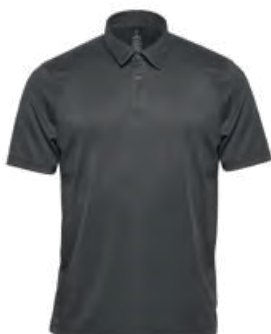
M'S & W'S: DOLPHIN