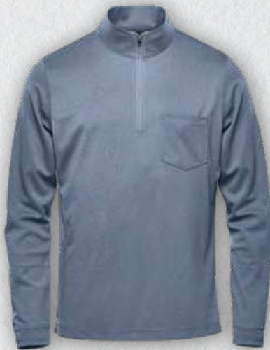
DOCKYARD 1/4 ZIP PULLOVER VQX-1 | VQX-1W