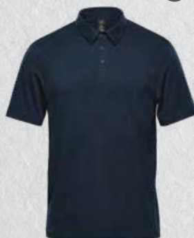
M'S & W'S: NAVY