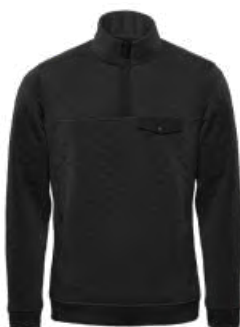
M'S & W'S: DARK CHARCOAL HEATHER