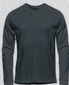
M'S & W'S: DOLPHIN