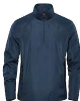
M'S & W'S: NAVY