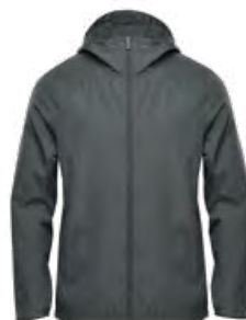
M'S & W'S: DOLPHIN