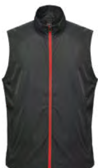
M'S & W'S: BLACK/BRIGHT RED