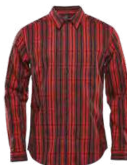
M'S & W'S: RED PLAID