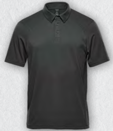
CAMINO PERFORMANCE S/S POLO TFX-1 | TFX-1W