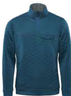
M'S & W'S: STEEL BLUE