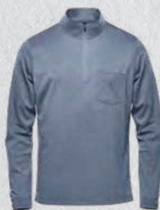
M'S & W'S: NAVY HEATHER