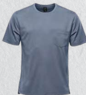
M'S & W'S: NAVY HEATHER