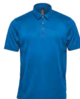
M'S & W'S: AZURE BLUE