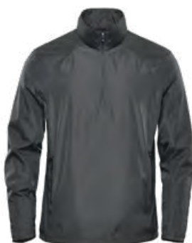
M'S & W'S: DOLPHIN