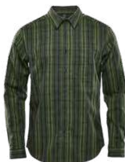
M'S & W'S: EARTH PLAID