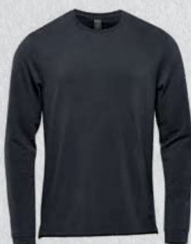
M'S & W'S: CHARCOAL HEATHER