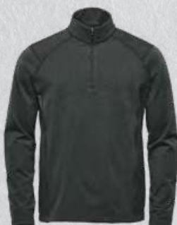
M'S & W'S: BLACK HEATHER