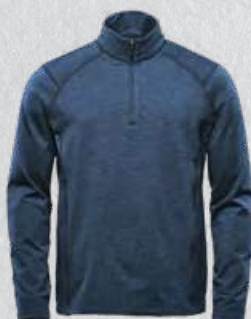
M'S & W'S: DARK NAVY HEATHER