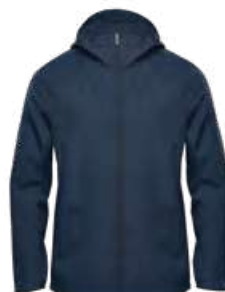
M'S & W'S: NAVY