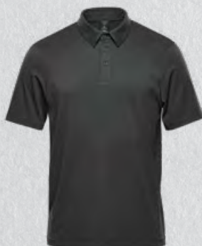
M'S & W'S: GRAPHITE