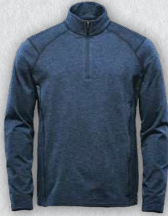
TREELINE PERFORMANCE 1/4 ZIP PULLOVER HTZ-2 | HTZ-2W