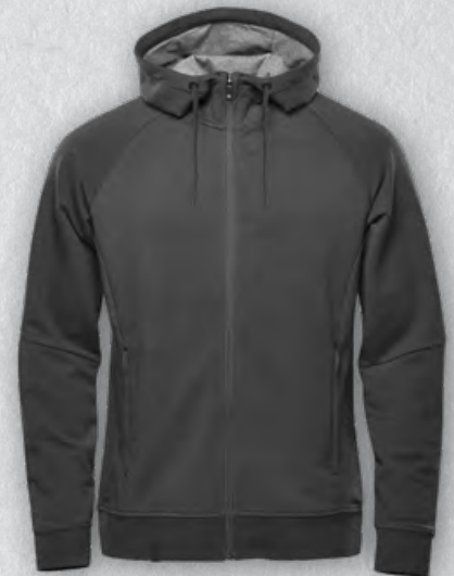
DOCKYARD PERFORMANCE FULL ZIP HOODY CFZ-6 | CFZ-6W