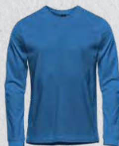
M'S & W'S: STEEL BLUE