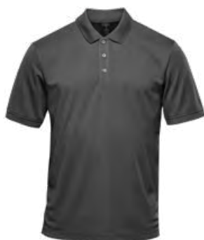
M'S & W'S: DOLPHIN