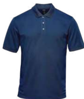
M'S & W'S: NAVY