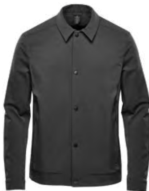
M'S & W'S: DOLPHIN