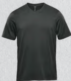
M'S & W'S: GRAPHITE