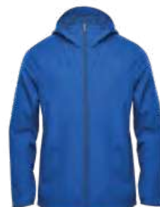
M'S & W'S: CLASSIC BLUE