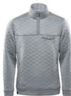
M'S & W'S: ASH HEATHER