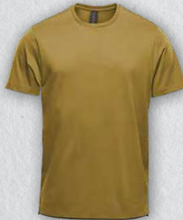
EQUINOX S/S TEE CPM-1 | CPM-1W