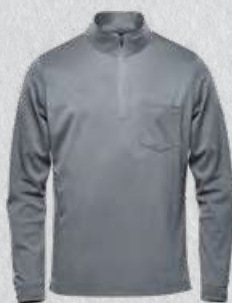
M'S & W'S: DOLPHIN HEATHER