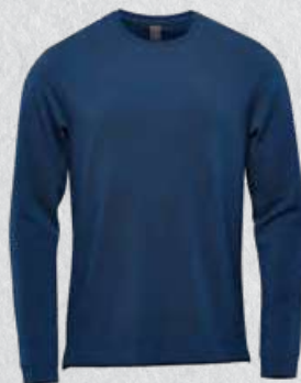
M'S & W'S: INDIGO