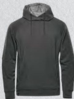
M'S & W'S: DOLPHIN